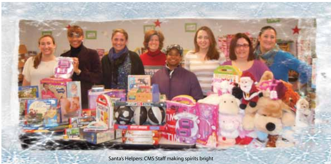
Santa's Helpers: CMS Staff making spirits bright

volunteers from the community and employees within our agency, came together to recreate Santa's workshop. A special thank you to those individuals who participated in this year's toy drive; whether it be by orchestrating a toy collection at your parish or school, going out and purchasing gifts for those in our care, or sacrificing your valuable time around the holidays to volunteer. Without each of you, our toy drive would not be able to make the holidays brighter for the thousands of individuals in our care. We are so very appreciative to all of those who helped make this year's Toy Drive the huge success that it was! ★