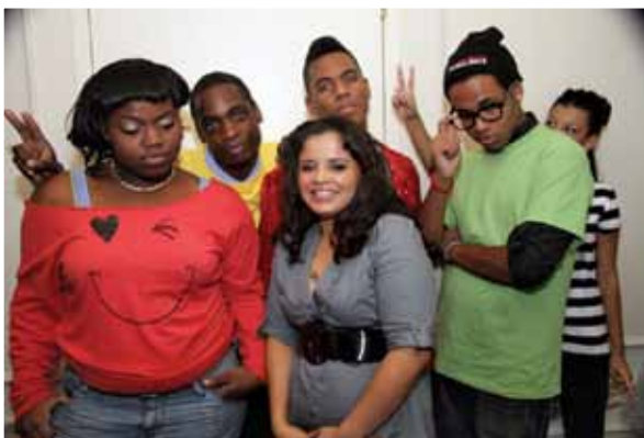
Some of our CMS Superstars rehearsing back stage